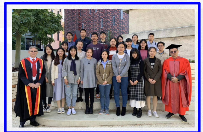
西澳大学2018年医学访学团项目